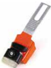
Part No. 901252 Cordless No mar tip