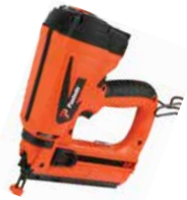
IML200 – 18 GAUGE FINISH NAILER