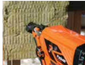
Applications Semi-rigid Insulation