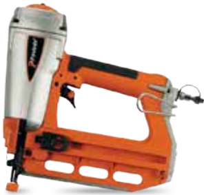
T250S F16 – 16 GAUGE FINISH NAILER