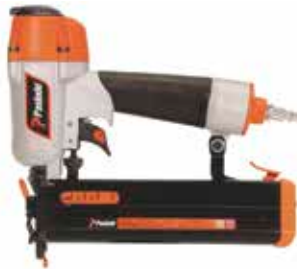
P18-FS200 – 18 GAUGE BRAD NAILER/STAPLER