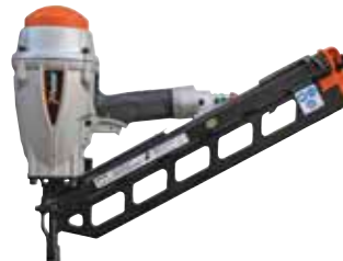
POWERMASTER PLUS 4" FRAMER