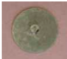
Part No. IFW-314 & IWF-238 Nail and Washer Combo - 3-1/4" & 2-3/8" with Galvanized Washers (1000/box)