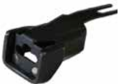
Part No. INSULPROBE Insul2Wood – Insulprobe