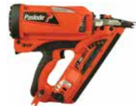
CORDLESS IMPULSE XP FRAMING NAILER