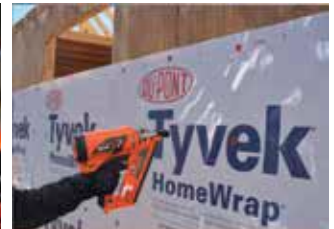
House wrap Fastening