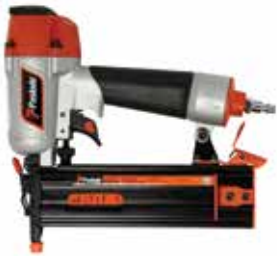
P18-200 – 18 GAUGE BRAD NAILER