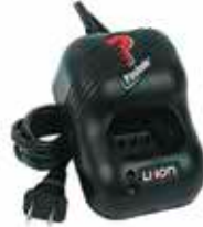
Part No. 902667C Lithium Battery Charger