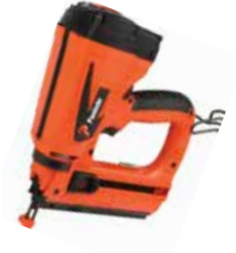
IMLi250 – 16 GAUGE FINISH NAILER