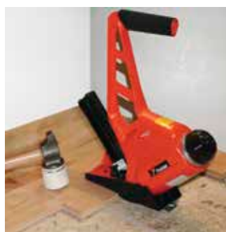
3/4" Hardwood flooring